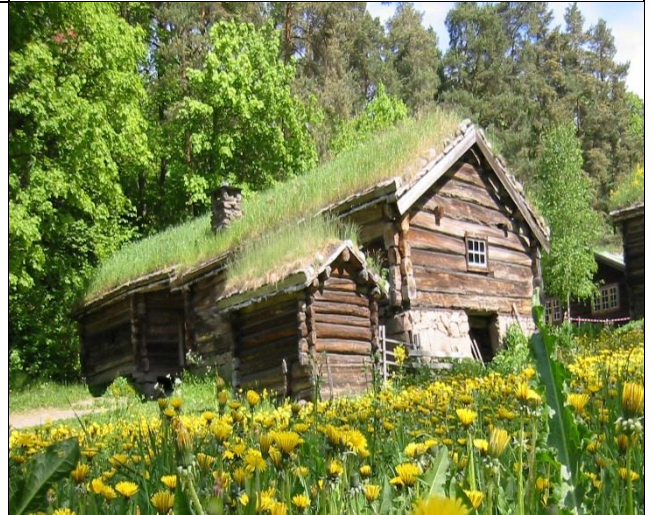
Challenge 4: Log House with Grass Roof in Norway