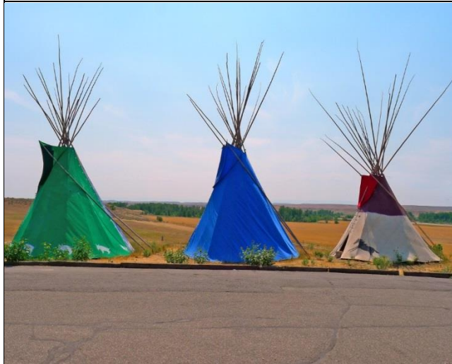
Challenge 2 : Three Blackfoot Tepees in Montana © Hank Miller