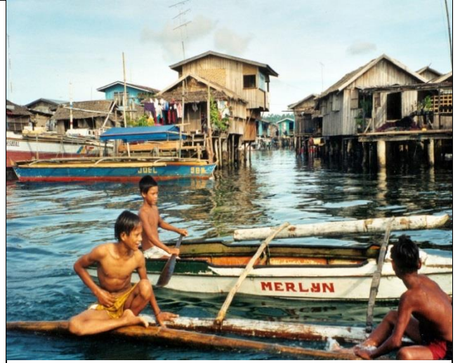
Challenge 3: A Nipa Hut on stilts in the Philippines