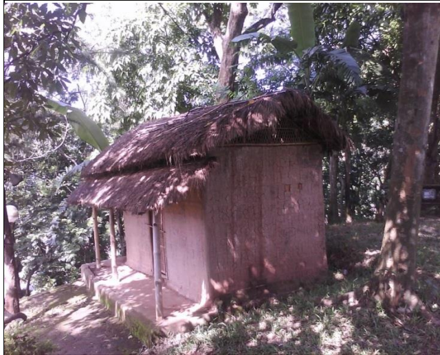
Challenge 1: A Mud Hut in India